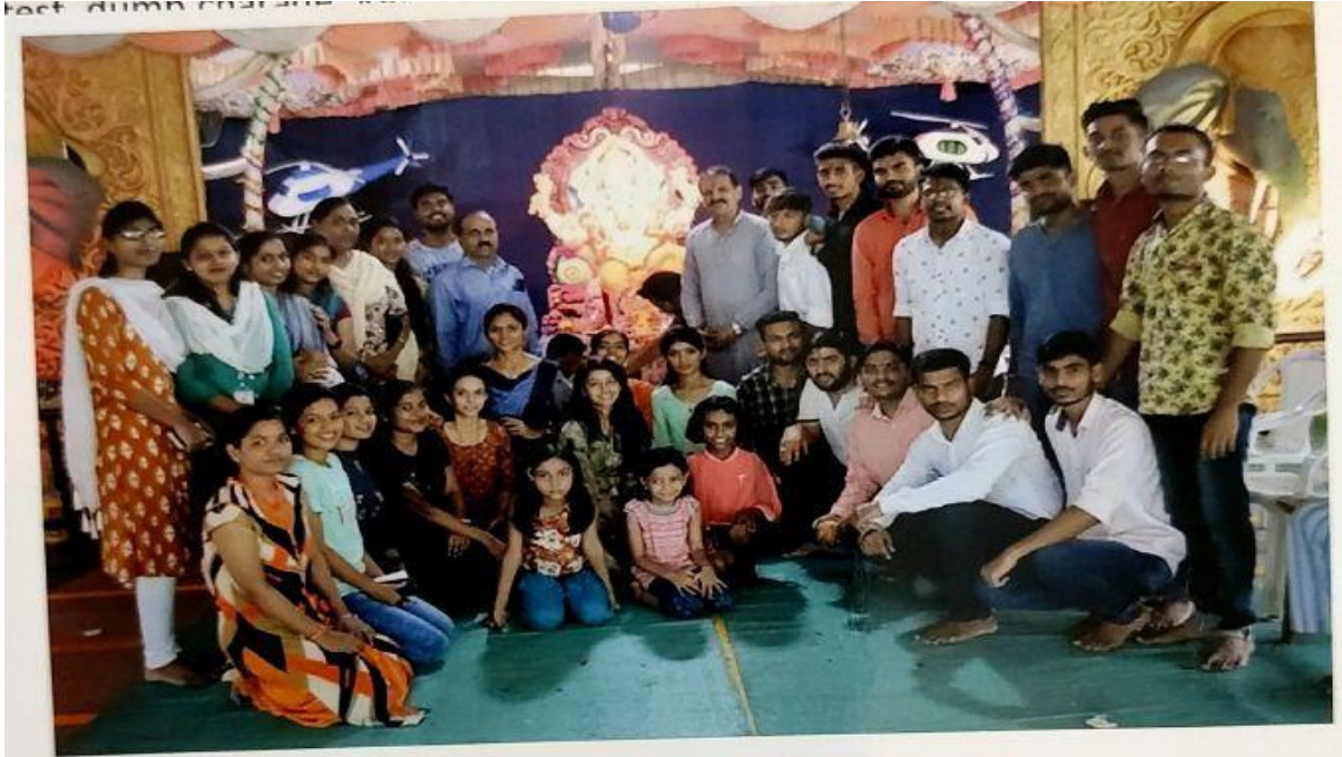
Ganesh Utsav 2019